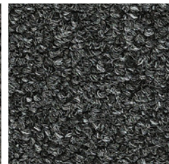
719 Steel Gray