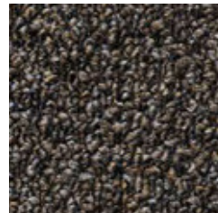
978 Twilight Shadow