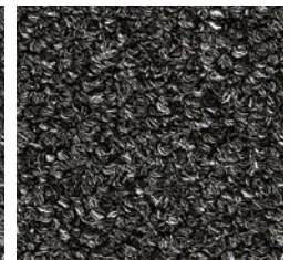
964 Stainless Steel