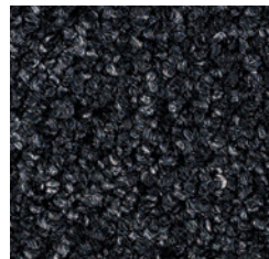
589 Blue Ribbon