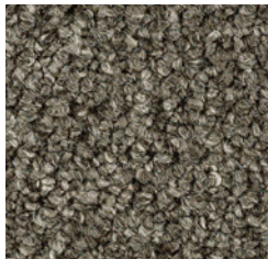
948 Birch Gray